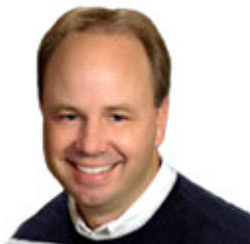
Founder, Setting Captives Free

95 Theses for Pure Reformation - A clear call to the church to be pure!